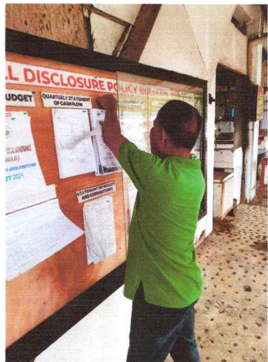
Tandag City Public Market