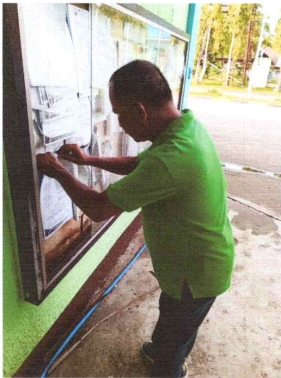
Tandag City Jeepney & Bus Terminal